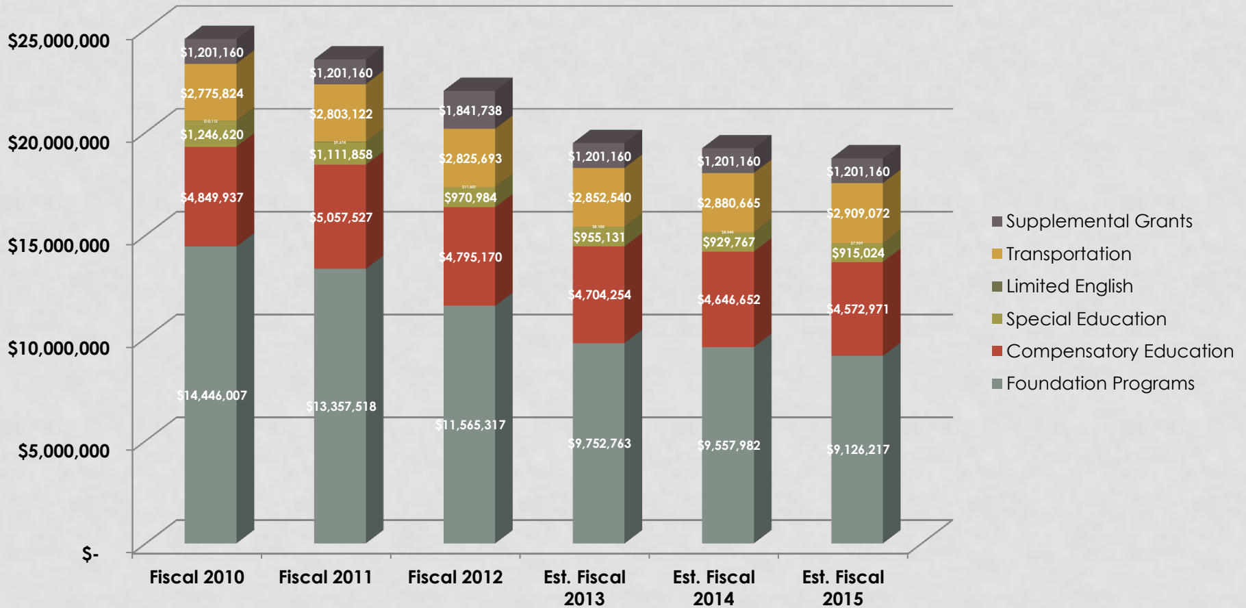
Garrett County Public Schools Historical and Projected State Aid